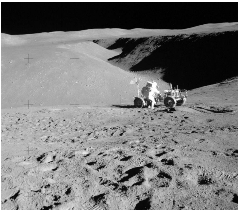
Yes it is! My favorite image from the space program! Hadley Rille – Apollo 15